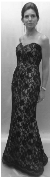
Gown by Illiana Collection

BRIDAL • EVENING • COCKTAIL • PROM/BAT MITZVAH