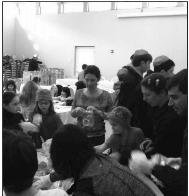
MLK Day On not Off event