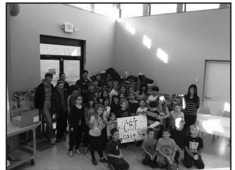
MLK Day On not Off event