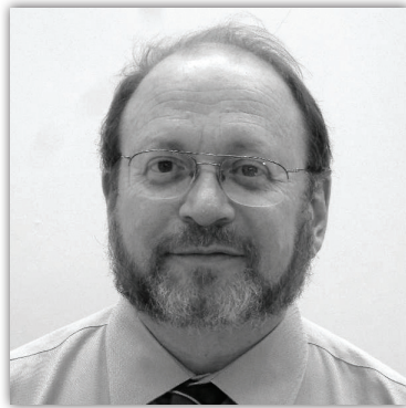
By Rabbi Steven Bayar

The word "Tzedakah" can be translated in different ways. Some translate it as "Charity" others as "the right thing to do." I choose to translate it as "rightful giving." This captures both the obligatory nature and the object (people in need) of the action.