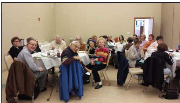
Adult Forum: Lunch & Movie