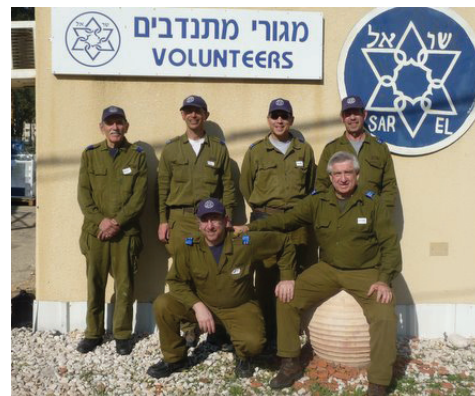
Posing in IDF uniforms is the Millburn Sar El group.

and the Knesset; others returned, however reluctantly, to Ben Gurion Airport directly from Tzfat. The 2011 Sar-El experience was impeccably planned, precisely executed, and a memorable experience. Each of our Men's Club volunteers, whether veteran Israel travelers or first-timers, contributed immeasurably to the welfare of the Jewish State, acquired friends from around the world, and enjoyed new and unique experiences in miraculous, magical, and mysterious Israel. Good onya!