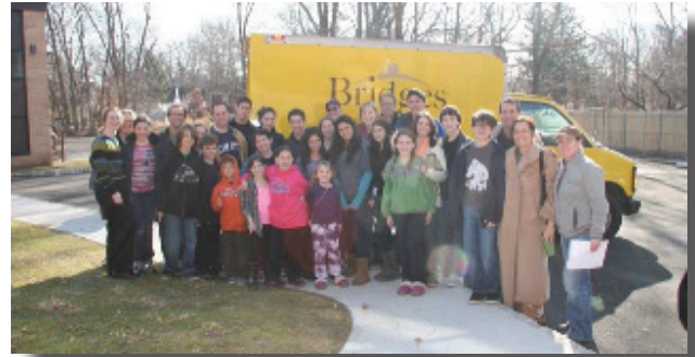
CBI Bridges event

We are so proud of our CBI teens that accompanied us on the run. If you see them, ask