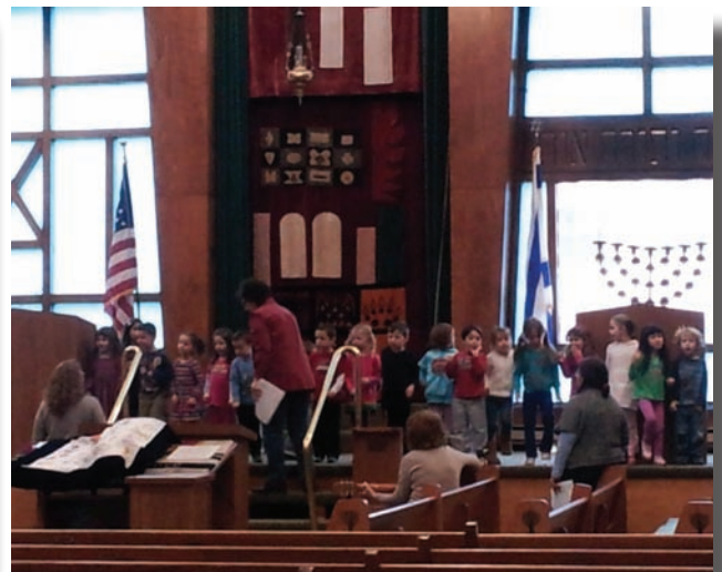
HGECC Chanukah rehearsal