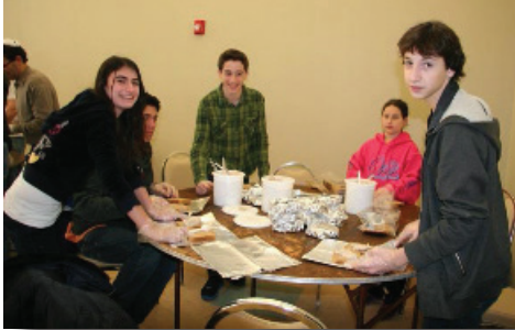
CBI Bridges event

Thank you to everyone who donated toys to the Holiday Toy Drive. Your generosity helped make the holidays special for the children of the Valerie Fund.