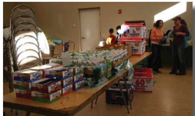
CBI Bridges event

MLK Day - A DAY ON, NOT OFF - Monday, January 16. Join us at CBI at 2:00pm sharp to make meals for others in need. This is open to adults and children - all helping hands are welcome! Food will be donated to people in need and placemats