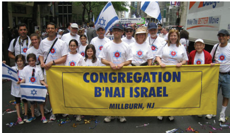
*Photo taken at the 2011 Salute to Israel Parade.

The Bus Will Leave CBI at 11:00 AM & Return at Approximately 4:30 PM