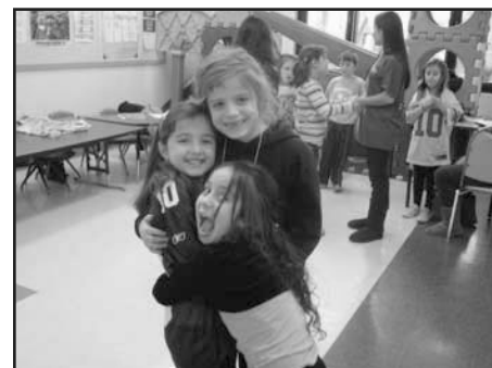
Primary Camp at BBRS means making friends!