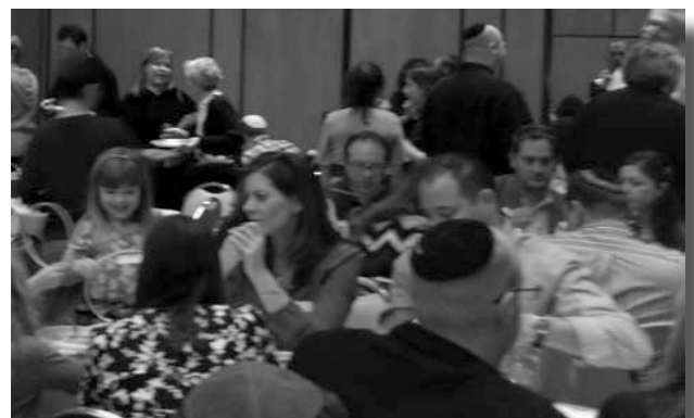
Dinner - CBI, Jan 28, 2012