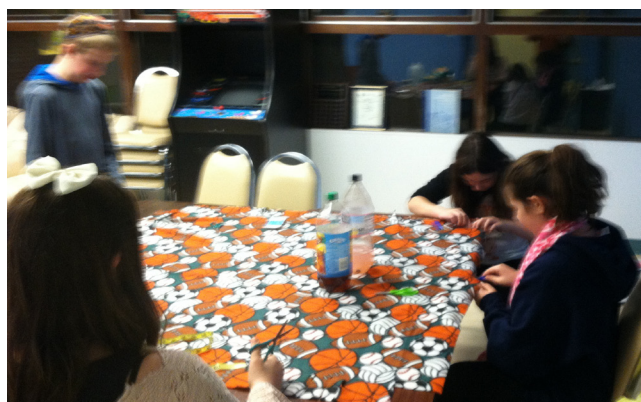
Kadima participating in Project Linus