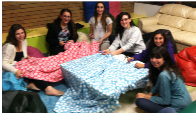
USY making no-sew blankets for Project Linus

USY kicked off the year with a Waffle Sundaes and Ice Breakers event in our youth lounge. There, we welcomed new members, reconnected with old ones, and, of course, ate tons of sugar. Next, we tie-dyed our new Millburn USY shirts outside at our Hippies in the Hut event. Some of us even played a few rounds of Messy Twister (think Twister, but add paint). The event was a huge success, as was Challah for Hunger, in which USY-ers braided, baked, and bought their own Challah, all for a great cause! Next came Food Olympics, in which USY-ers demonstrated talent and competition in some creative challenges involving everyone's favorite kosher snacks. Finally, we frosted cupcakes, decorated holiday cards for active soldiers, and made blankets for Project Linus, an organization that provides blankets for critically ill children at our Birthday Party/Project Linus event. Come join Millburn USY for these exciting events to come: Chanukah Casino Night, and Candy Sushi/Game Night. Also, be sure to keep an eye out for the upcoming Winter and Spring calendar!