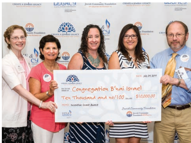
B'nai Israel with check