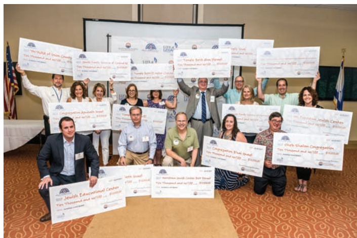
CJL Teams with Big Checks