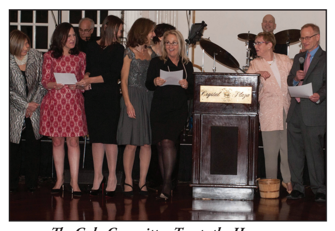
The Gala Committee Toasts the Honorees