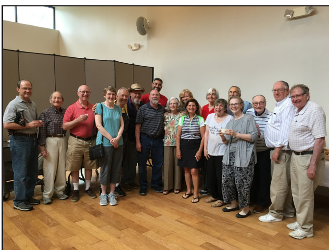
Friday Morning Minyanaires at Breakfast